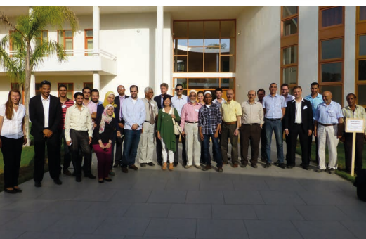
Conference participants after the solar thermal energy demo plant at SEKEM's main farm.

Egypt's solar energy potential, emphasizing the need for establishing a culture of quality in education and research in Egypt.