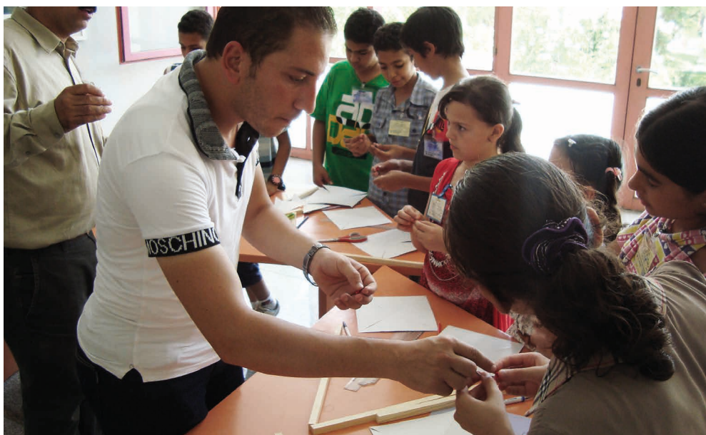
Teachers from the EduCamp project working with participating children.

With full day of events and games, the newly inaugurated Heliopolis University Centre of Excellence, created as part of the EduCamp project, opens.