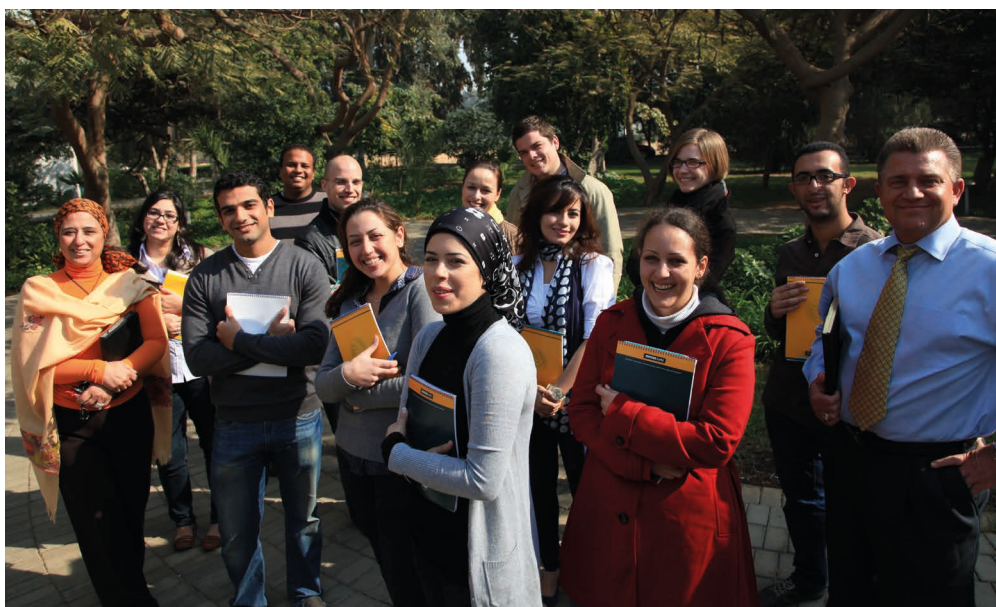
At Heliopolis University and Egyptian and foreign students and co-workers collaborate at three faculties dedicated to sustainable development issues.

The Austrian SEKEM friends have endowed the Heliopolis University with two „Austria Scholarships“ to support SEKEM's educational work for the disadvantaged in Egypt.